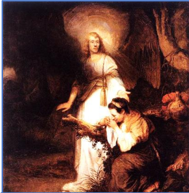
Carel Fabritius, Hagar and the Angel Residenzgalerie Salzburg, Austria, Vanderbilt Divinity Library, http://diglib.library.vanderbilt.edu/ . All images available via Creative Commons 3.0 License.

Among the patriarchs, Abraham, his son Isaac, and grandson Jacob, the multitudinous nations of the people of Israel emerge. Yet God promises to Hagar here in this text, “I will make a great nation of [Ishmael]” (21:18). God even