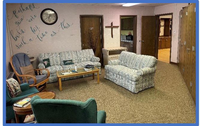
Our "new" lounge space off the sanctuary – open to all! Before-after-during service ~ anytime!

Before I arrived, I am told the former youth room was lined with recliners and swivel rockers. It was a bit durgy. With lots of help and the approval of trustees, chairs were given to "Caring and Sharing", and some were given through Facebook. New spaces were designated as youth rooms closer to the narthex. We inquired with youth and received their input along with donations of foosball and ping pong tables, bean bag chairs, high-top stools, as well as games, food, and soda donations. The space has a microwave, pop machine, and a Keurig machine. Keeping these in mind: